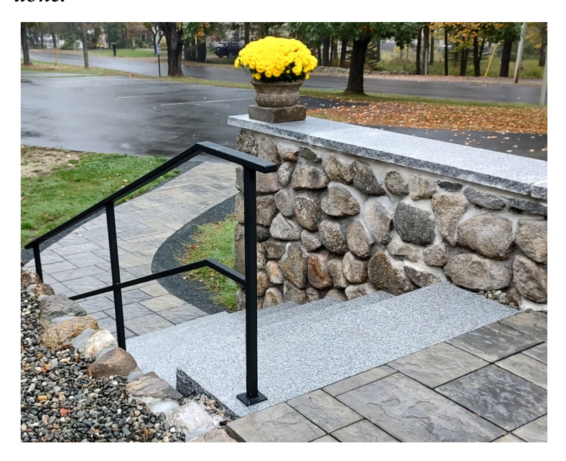
New handrails have been installed on both sets of stairways – upper and lower ( pictured )-- leading to the recently refurbished patio.

This drain is located on the exterior corner of the Thrift Shop. We recently excavated the pipe leading to this drain because the pipe was crushed and no longer carried ground water away from the building. A new pipe was installed and the system is back in operation, eliminating an odor that had been noticed over many months.